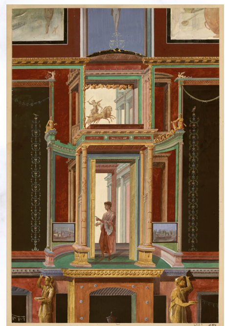
Pompei (Italy), Relief of a Pompeian painting, Charles Garnier