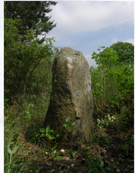
Skuodo (Lithuania), The Krakly stone Stabakūlis, Aruodai