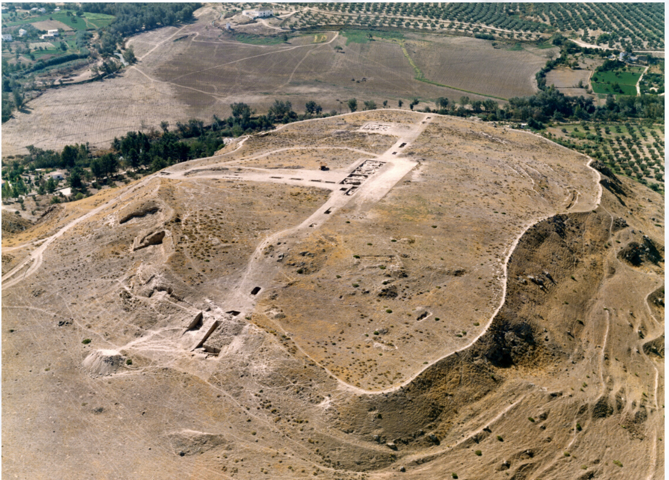
Jaen (Spain), Iberian oppidum of Puente Tablas, Instituto de Arqueología Ibérica-Universidad de Jaén

Europeana Archaeology (February 2019 - July 2020) is a Project funded by the European Commission within the Programme Connecting Europe Facility: Telecom.