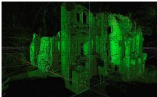
Ruins of the von Dewitz castle in Dobra Nowogardzka, zachodniopomorskie voivodship.

At the moment the collection includes images, point clouds, 3D models and plans of 17 monuments (churches, castles, fortifications). Another 169 monuments are scheduled for scanning in the near future.