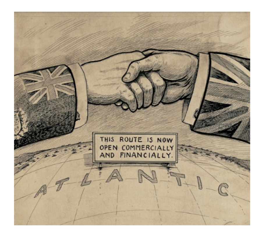
<u>A handshake between Canada and Britain over the Atlantic</u> <u>Ocean</u>

The process can take a few days. We will share a preview of the content with you before it goes live.