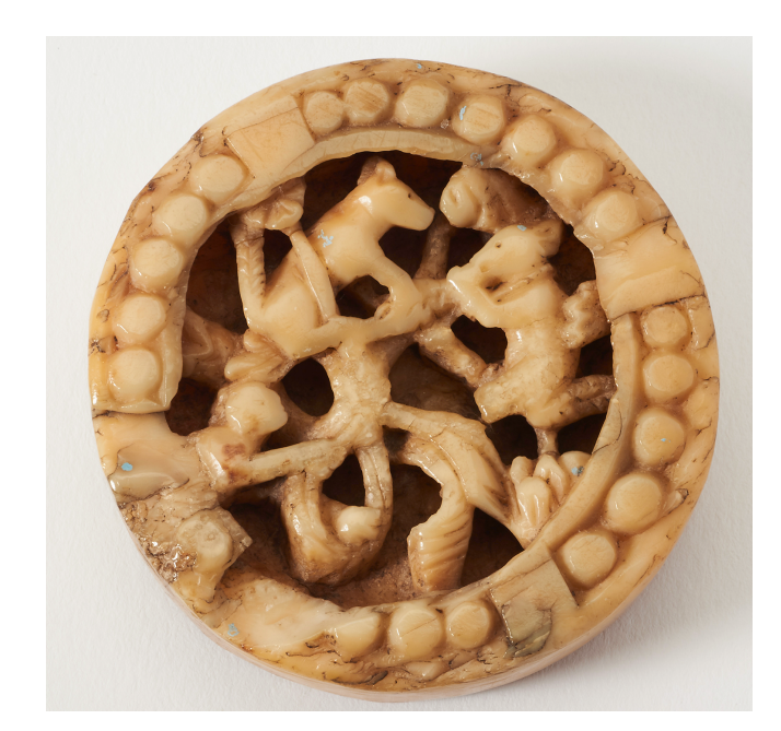
Ivory Game Piece with animals, Hunt Museum, CCO

We will ask you to sign a cooperation agreements with CARARE to enable us to share your data with Europeana and/or ARIADNE Plus.